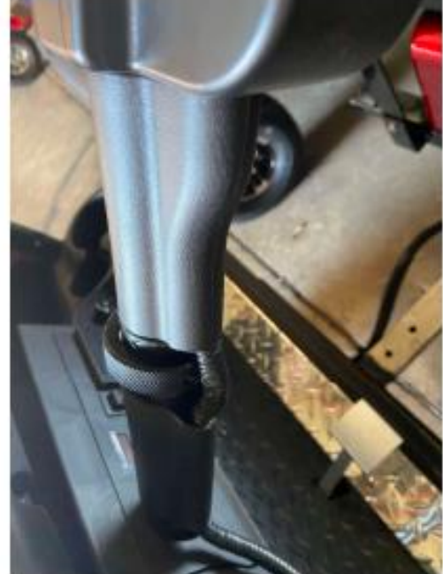
Figure 2.2.2 RX5 Wiring Harness Clips