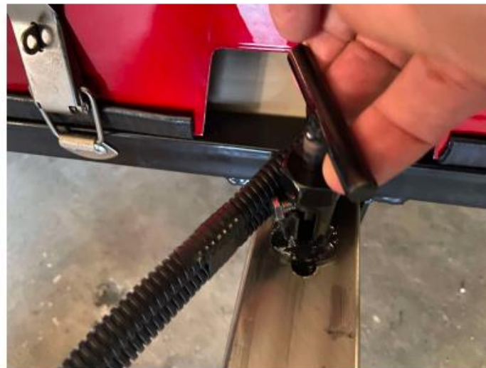
Figure 3.1.1 RX5 T-Lever Released

3.1. Use your hand to pull up on the spring-loaded T-Lever in the center of the permanent floorboard. Turn the lever clockwise until it locks open. (Fig. 3.1.1)