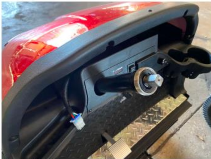
Figure 2.1.1 RX5 Lower Steering Shaft