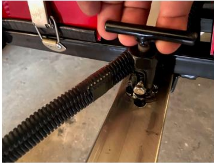
Figure 3.2.2 RX5 T-Lever Locked

3.3. Remove the floorboard knobs from both sides of the chassis, located just under the front seat on the frame.