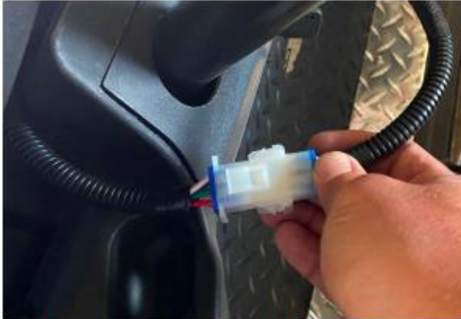
Figure 2.2.1 RX5 Wiring Harness Connector