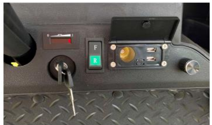
RX5 Dash Panel

Entering the Vehicle: All passengers (including driver) must always be seated while the CRICKET vehicle is in use.