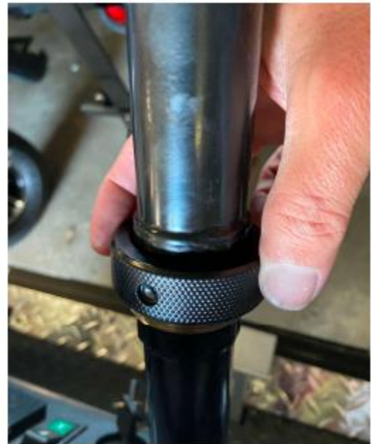
Figure 2.1.2 RX5 Steering Shaft Nut